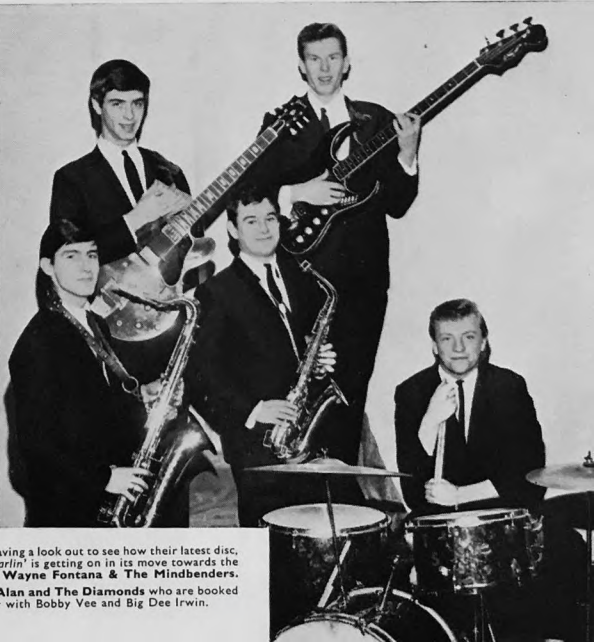
Left: Having a look out to see how their latest disc, Little Darlin' , is getting on in its move towards the charts, Wayne Fontana & The Mindbenders .